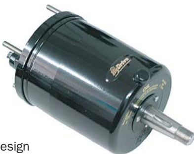
Front - mount design Model 101 - FM or 102 - FM