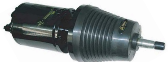
Fully tilting helm design Model 101 - Tilt or 102 - Tilt